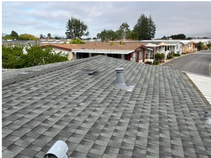
Project: https://app.companycam.com/projects/101950594