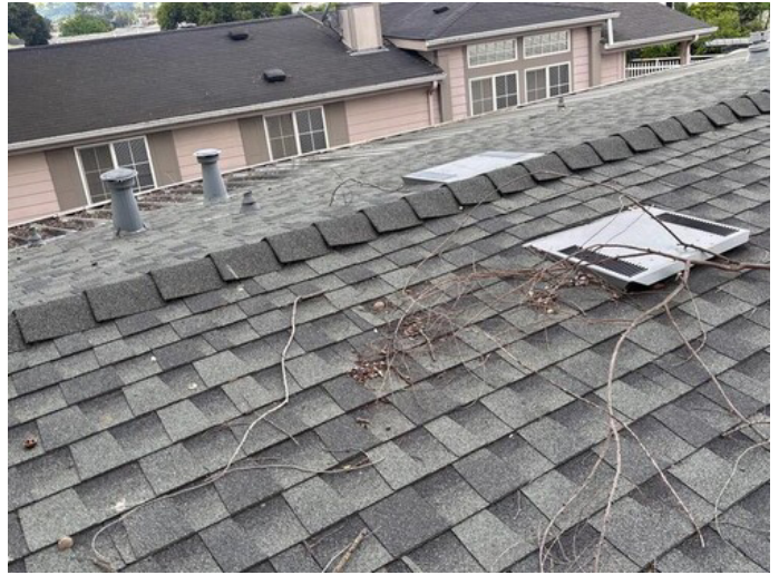
Project: https://app.companycam.com/projects/101950594