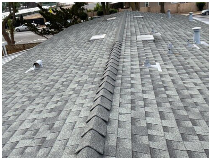
Project: https://app.companycam.com/projects/101950594