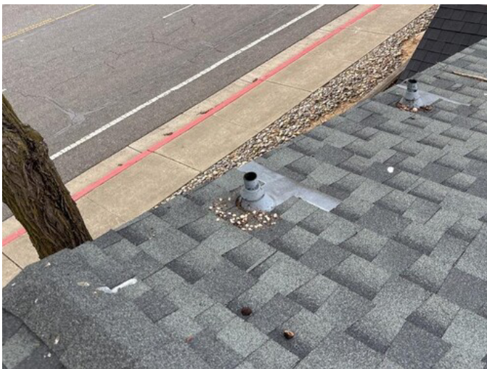
Project: https://app.companycam.com/projects/101950594