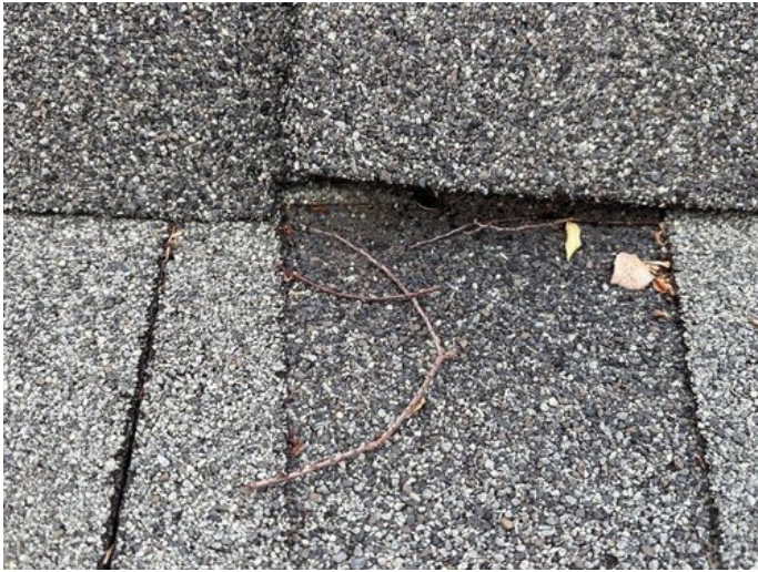
Project: https://app.companycam.com/projects/101950594