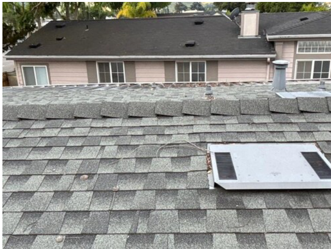
Project: https://app.companycam.com/projects/101950594